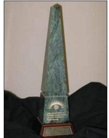
Richard C. Troutman MD DSc (HON) Prize