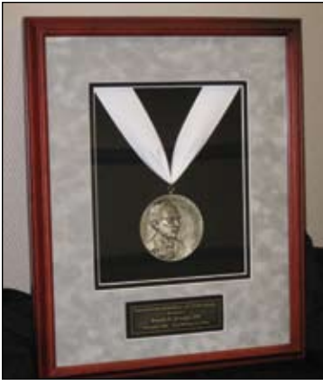
Kritzinger Memorial Lectureship Award