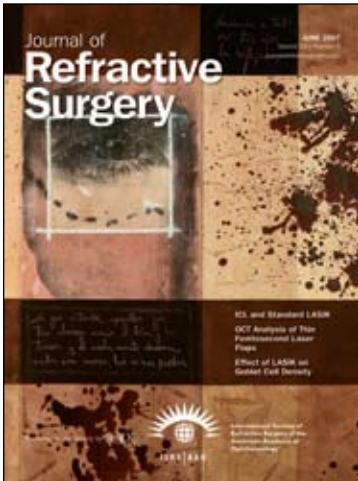
Journal of Refractive Surgery (2007)