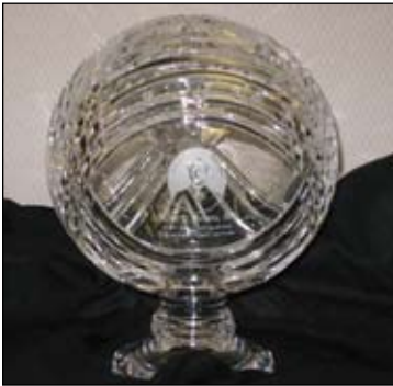
Lans Distinguished Lecturer Award