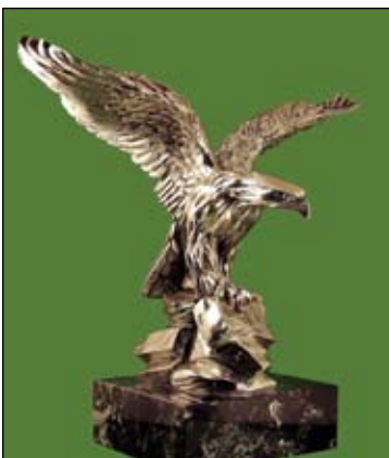
Casebeer Lecture Award

Recognizes the outstanding contribution to refractive surgery through non-traditional research and development activities.