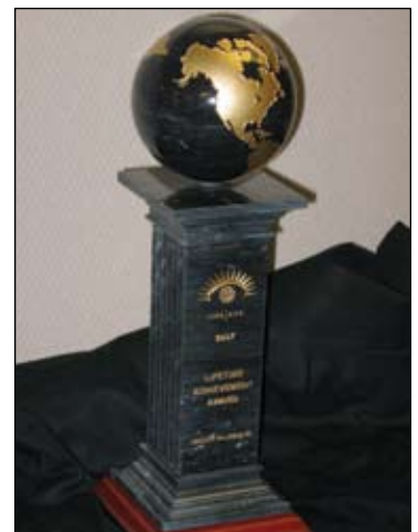
Lifetime Achievement Award