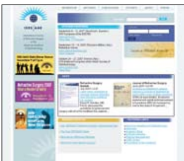
ISRS/AAO Web site (www.isrs.org)