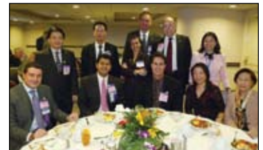
ISRS/AAO International Council Luncheon in Anaheim (2003)