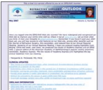
Refractive Surgery Outlook (2007)