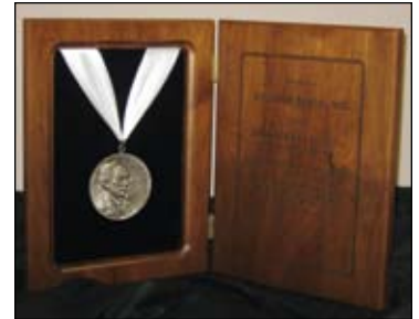
Barraquer Lecture and Award