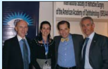
Dr. Alió with attendees of the Alicante Congress in Spain (2007)