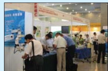
Exhibit Floor at the ISRS/AAO Meeting in Beijing (2007)