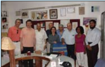
Attendees at the International Intraocular Implant and Refractive Surgery Meeting in India (2006)