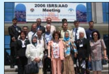
ISRS/AAO Annual Regional Meeting in Istanbul, Turkey (2006)