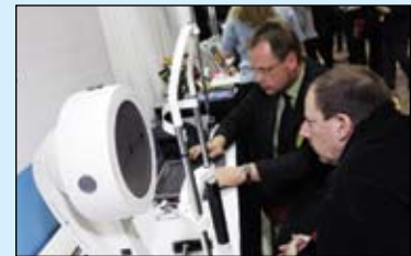
Refractive Surgery Subspecialty Day exhibits (2006)