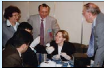
Wet lab during Athens Meeting (2001)