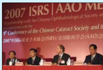
ISRS/AAO Annual Regional Meeting in Beijing, China (2007)