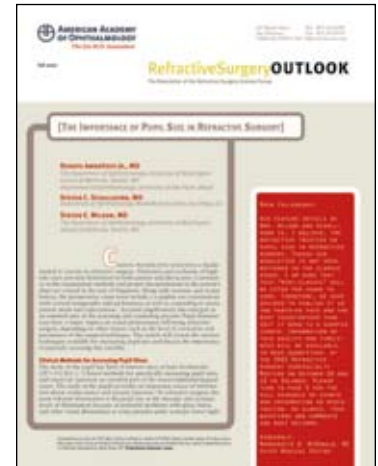
Refractive Surgery Outlook (2002)

The Society has maintained its traditional program with the presentation of the Barraquer and Lans Awards, in addition to acknowledgement of other award recipients. Today, the joint program includes a structured and classical review of refractive surgery and presentations of new and emerging technologies. The overall program also features both invited and free papers.