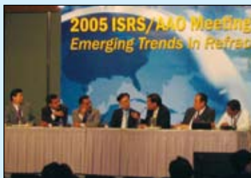
ISRS/AAO Annual Regional Meeting in Hong Kong (2005)