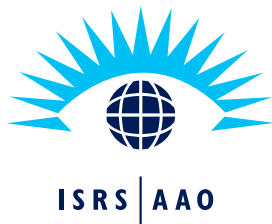
The ISRS/AAO logo