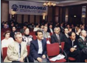
ISRS event in Russia (1990)