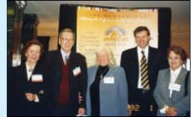
Attendees of the 2nd ISRS Symposium in Russia (2000)