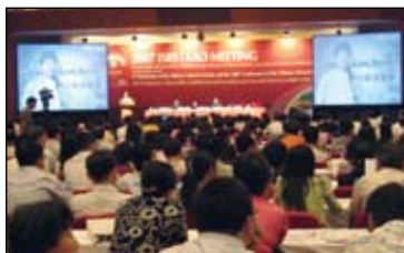
ISRS/AAO Annual Regional Meeting in Beijing, China