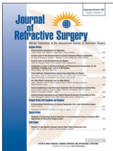
Journal of Refractive Surgery (1997)