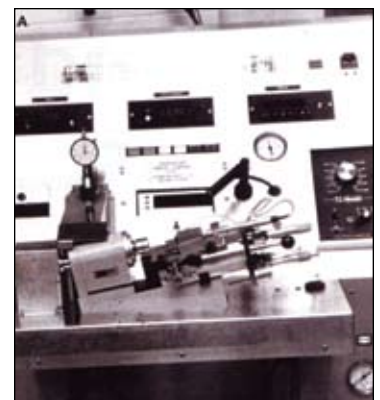
Cryolathe used for early lamellar surgery