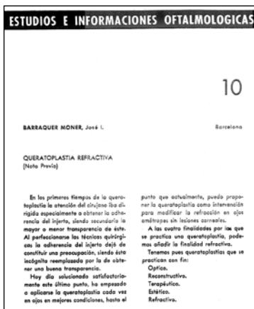
Dr. Barraquer's 1949 paper, "Refractive Keratoplasty"