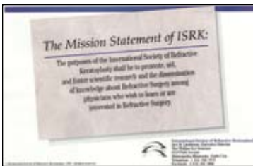
Mission Statement of ISRK